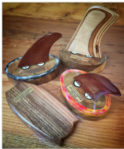
Personalised trophies for the MHS Surf Contest