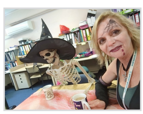
NOVEMBER 2020 - 5th November