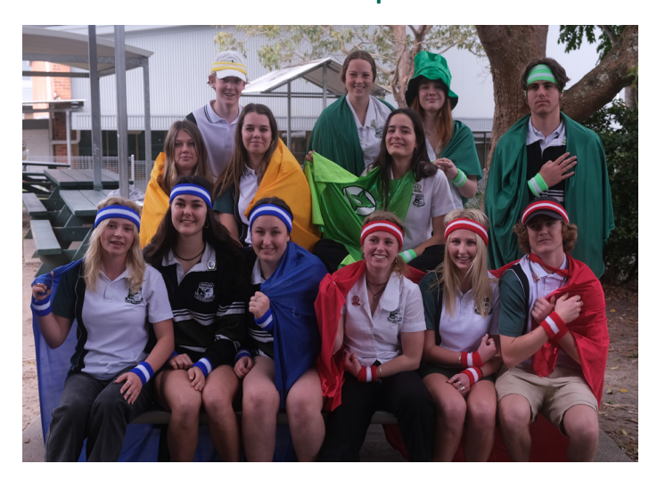
Maclean High School